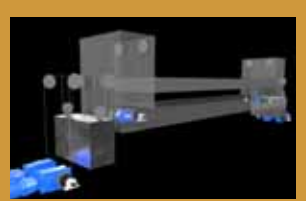
Below stage lifting systems