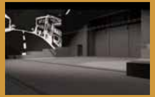
Stage in place