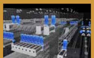
Overhead Wire Winch System