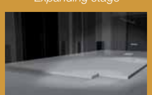
Stage in place