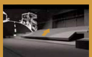
Fold for storage below