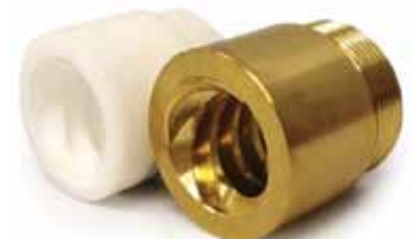
1/2 inch to 1-1/2 inch bronze and plastic nuts available in select T.P.I

Please contact our customer service department for assistance.