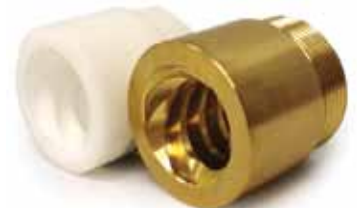
1/2 inch to 1-1/2 inch bronze and plastic nuts available in select T.P.I

Please contact our customer service department for assistance.