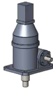
Anti-Rotating Ball Screw

If your application involves a load which is unattached or the load is free to rotate, the translating screw actuator must be configured so that the lifting screw will extend when the actuator is in motion. To prevent the translating screw from rotating, machine screw actuators are supplied with a keyed shell and screw, and ball screw actuators are supplied with a square nut on the lifting screw's end, inside a square cover pipe. Both of these configurations ensure the actuator will properly perform for this type of application.